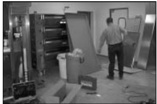
A worker readies Pierce's new bakery. Many new changes and fresh updates are in the works at Pierce's Marketplace for mid-2008.

NEWS BREAK is here to let other Chamber Members know about your business and the products or services you provide. Let us know about your new products, equipment or services you provide so we can help get the word out. Tell us about employee promotions and even sales or events you plan on sponsoring. E-mail graphics@portagewi.com or call the Chamber at 742-6242.